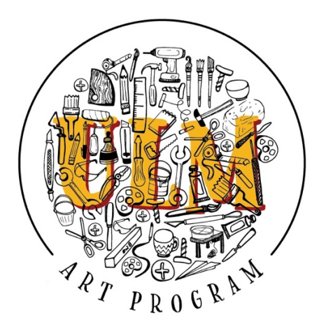
CAMP INFO JUNE 11-14, 2024

Camp Dates: Start: June 11-14, 2024 - 10:00AM - 5:00PM